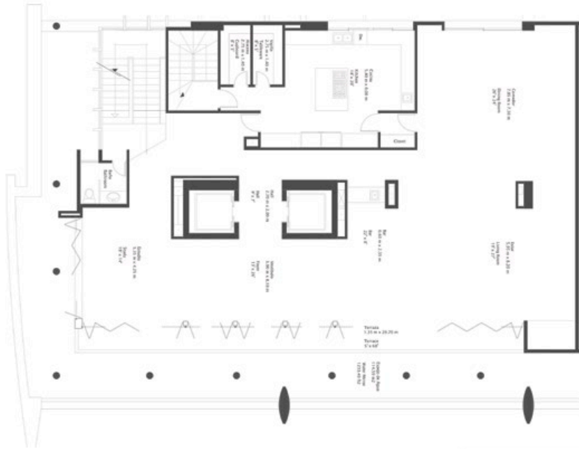
FIRST LEVEL - PRIMER PISO

AVAILABLE AT LEVELS 13 AND 14 DISPONIBLE EN LOS PISOS 13 Y 14